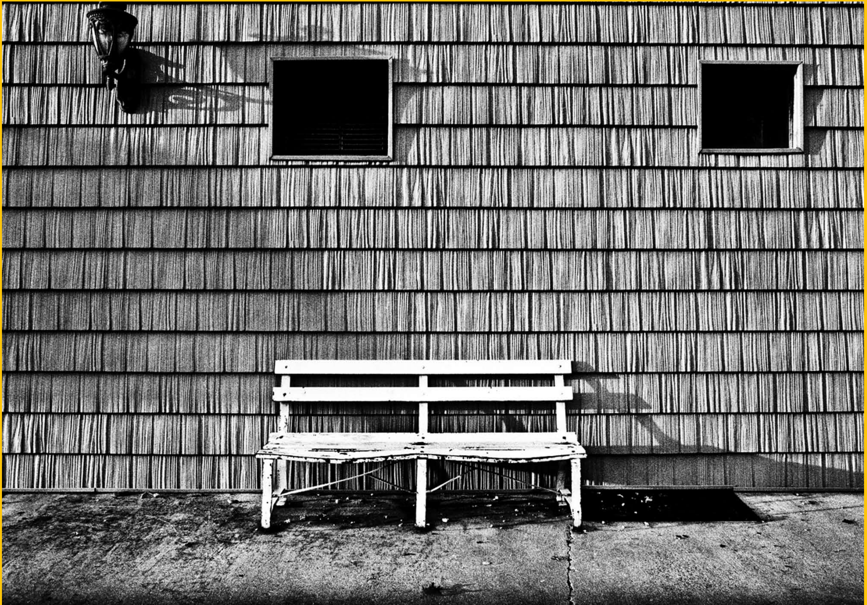
UNTITLED ERIN O'LEARY