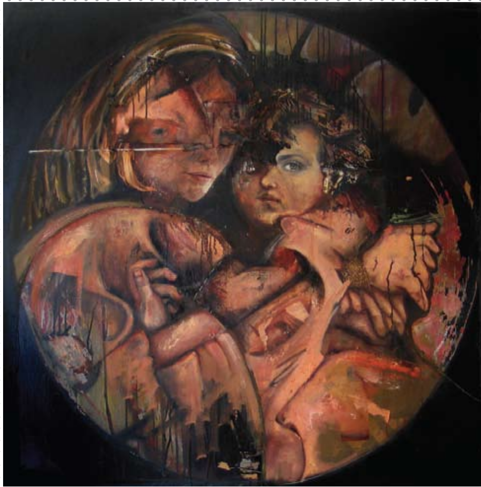
MADONNA DELL SEDIA (oil, ink, collage, and spray paint)