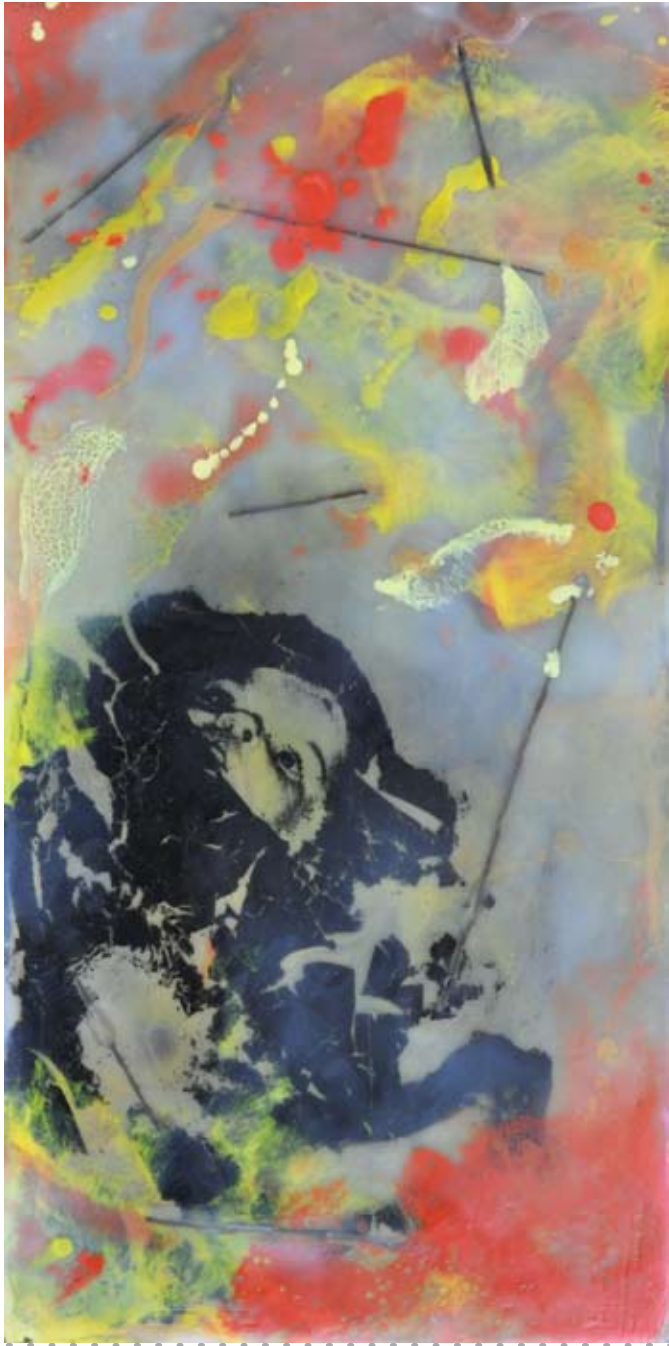
LAVA LANTHE (encaustic wax and pigments with Xerox transfer on masonite) KRISTEN HUBBARD