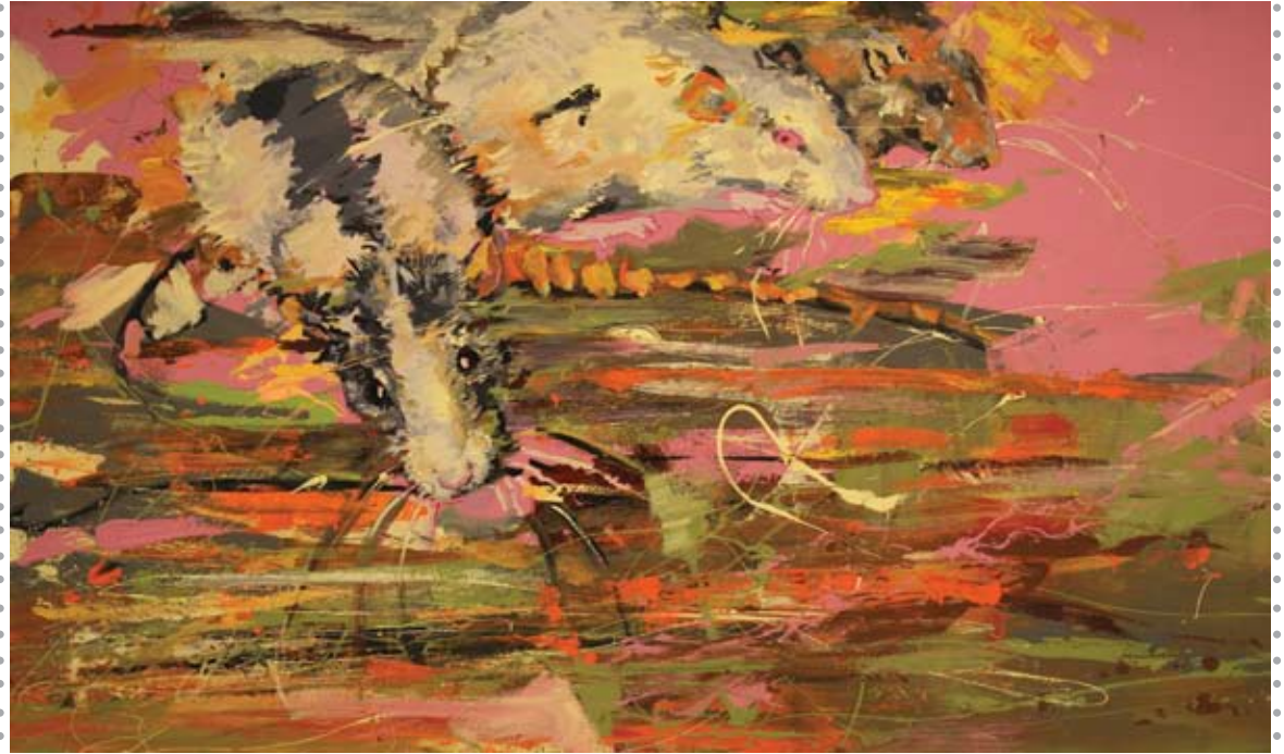
RATTUS-RATTUS (mixed media) DANIELLE WILBERT