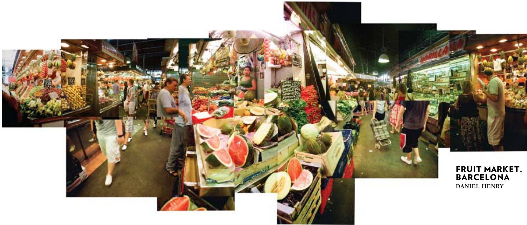
FRUIT MARKET, BARCELONA