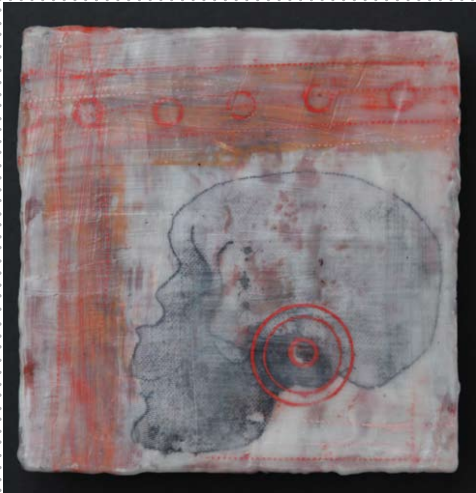
IT HURTS HERE ( encaustic and photo-transfer on board ) BECKY DICKOVITCH