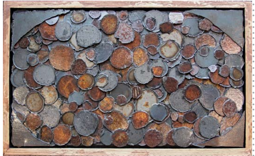
PEBBLES BRANDON WOODS